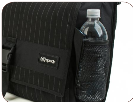
Expandable mesh zippered water bottle pocket