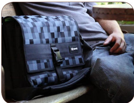
Plush, padded strap and back panel, carry lots of things comfortably!