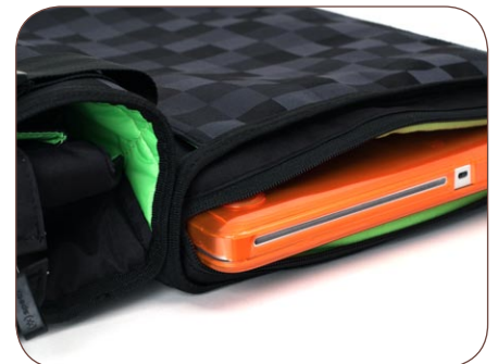
TSA/Airport Compliant Laptop Pocket